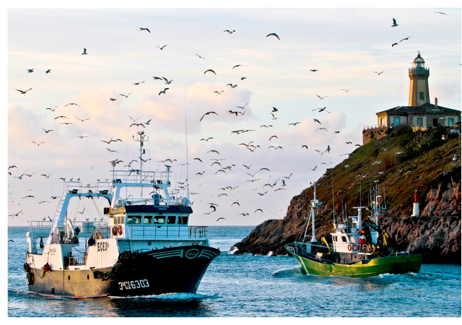
Where industry meets nature: Ría de Avilés

We are leveraging our native breeds and agricultural traditions to drive sustainable development. The region promotes seven native breeds, including the Pita Pinta hen and the Gochu Asturcelta pig, valued for their unique qualities such as healthier fat content. Efforts to revive traditional markets, branded as "Mercados del Paraíso," focus on eco-friendly local products that reflect Asturias' identity as a natural paradise.