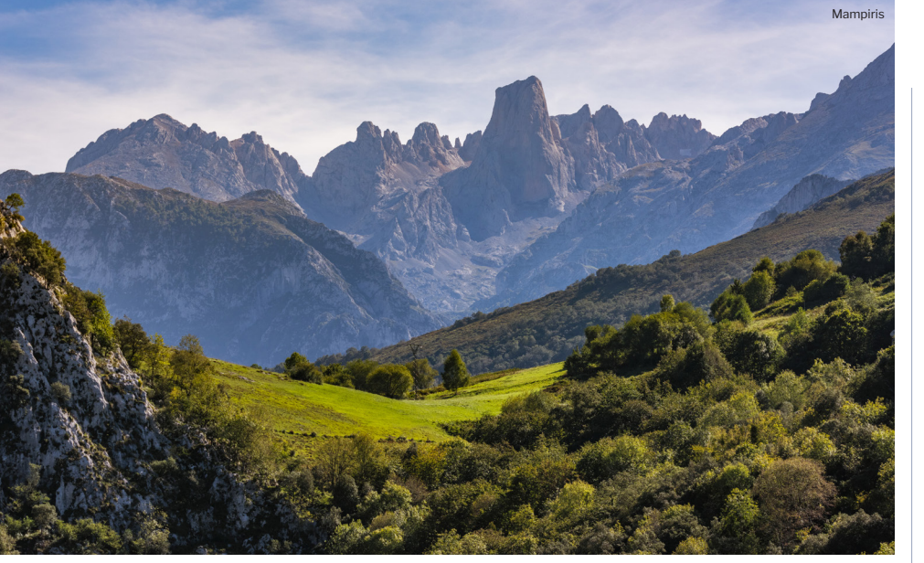
Picu Urriellu: The Heart of Picos de Europa National Park

We also offer a unique urban trio—Oviedo, Gijón, and Avilés—each with its own distinct charm. Oviedo is known for its UNESCO World Heritage preromanesque sites, the Museum of Fine Arts, and its role in the Camino de Santiago. Gijón, with its beach and maritime heritage, boasts a rich Roman history. Avilés, a hidden gem, features the Niemeyer Center and an impressive historic quarter.