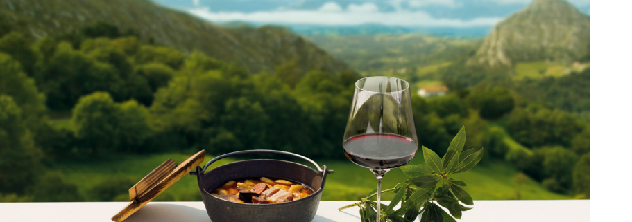
Asturias: Renowned for its Agricultural Exports & Gastronomy