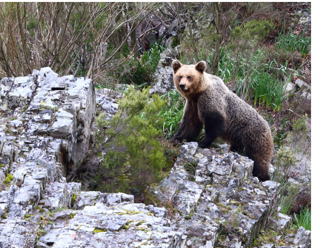
A Haven for Wildlife: Fuentes del Narcea