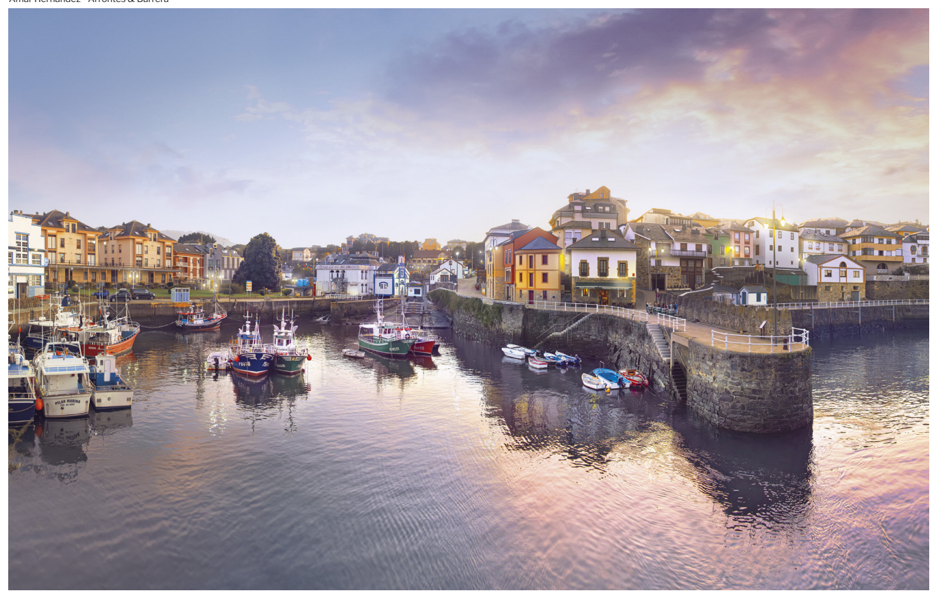
Sunset casts a golden glow over the serene beauty of Puerto de Vega